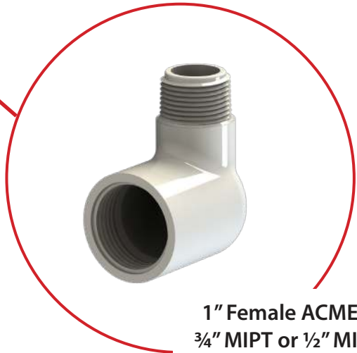
1" Female ACME x 3/4" MIPT or 1/2" MIPT