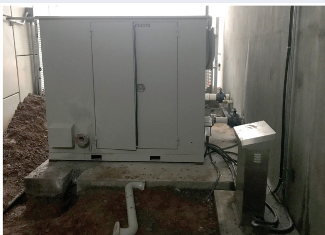
Separate Home Depot Backyard cistern pumping system installation after cistern installation.